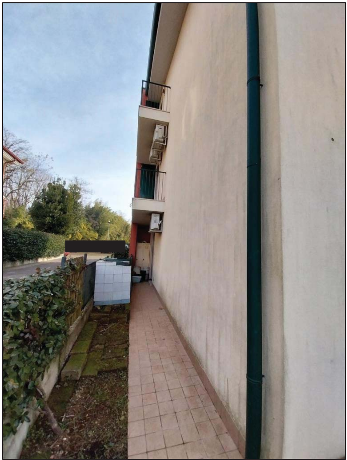
4) Area scoperta esclusiva – lato nord