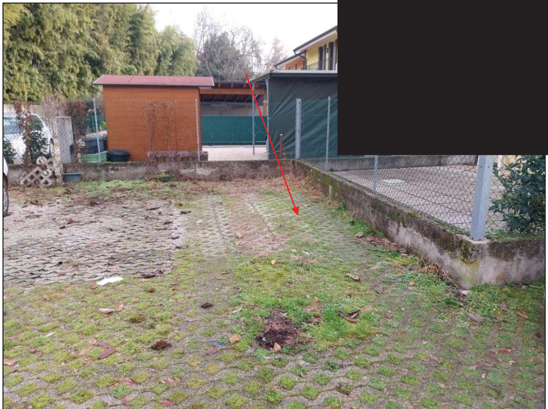
12) Posto auto esterno