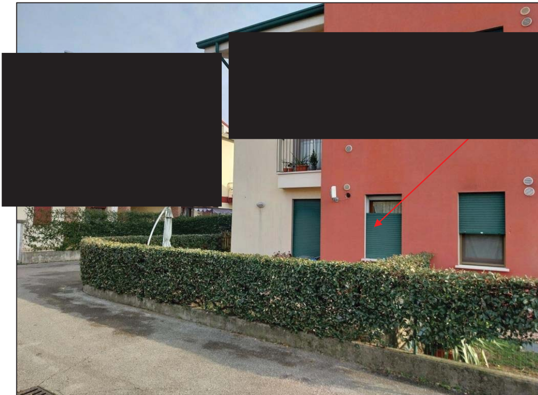
1) Lato ovest