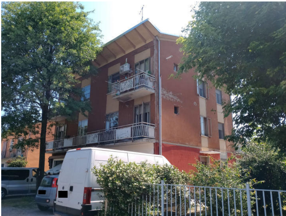
2. VISTA DA SUD/OVEST