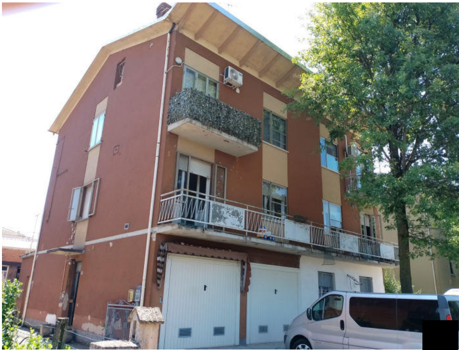
1. VISTA DA NORD/OVEST